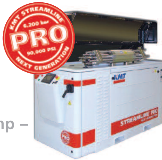
STREAMLINE™ PRO-I 60

The latest generation of STREAMLINE™ PRO high-pressure pumps sets new standards in waterjet cutting technology. The innovative high pressure pumps have been specifically designed for abrasive waterjet cutting at operating pressures of up to 6200 bar.