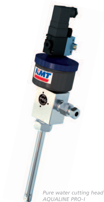
Pure water cutting head AQUALINE PRO-I

The wide range of cutting tasks and numerous switching cycles put a heavy strain on the nozzle valve. With the AQUALINE PRO pure water cutting head, KMT Waterjet has now developed the perfect solution for 6200 bar applications. As the cutting speed is higher than with 4000 bar, delamination is significantly reduced, and in many cases completely eliminated. Depending on the actual requirements, the valves are available as normally open (N/O) or normally closed (N/C) valves. These high-pressure valves normally open in less than 50 ms, depending on the operating pressure. High precision, sturdy design and extremely short switching times are the key features of the AQUALINE PRO waterjet cutting head range.