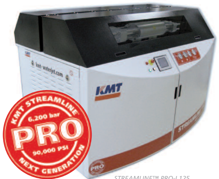
STREAMLINE™ PRO-I 125

heads. In the PRO-I 125 with 93 kW, the cutting pressure of 6200 bar is produced with the help of two pressure intensifiers operated with a phase shift that pump the cutting water through a 1.6 l pressure accumulator to the cutting heads. The standard model comes with a proportional pressure control system for the stepless adjustment of the cutting pressure. It is also equipped with a pressure transducer monitoring the cutting pressure in the high pressure line. This control circuit ensures equal utilisation of the two pressure intensifiers and optimises the pressure signal which significantly affects the cutting edge quality of the workpiece.