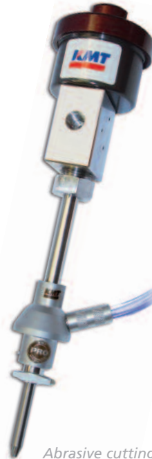
Abrasive cutting head ACTIVE AUTOLINE™ PRO-I

The diamond orifice is integrated into the orifice body. A specially devised manufacturing method ensures that the waterjet is at all times properly aligned and connected to the mixing chamber located below the orifice body. In the mixing chamber, the abrasive is added to the waterjet. The stringent production tolerances for the mounted cutting head guarantee that the cutting jet is always properly aligned along the axis. As the waterjet exits the focusing tube at the correct angle, the power of the waterjet is focused for optimum impact. This allows for maximum cutting speeds at minimum cutting gaps combined with excellent cutting edge quality.