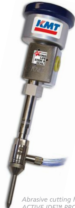
Abrasive cutting head ACTIVE IDE™ PRO-I